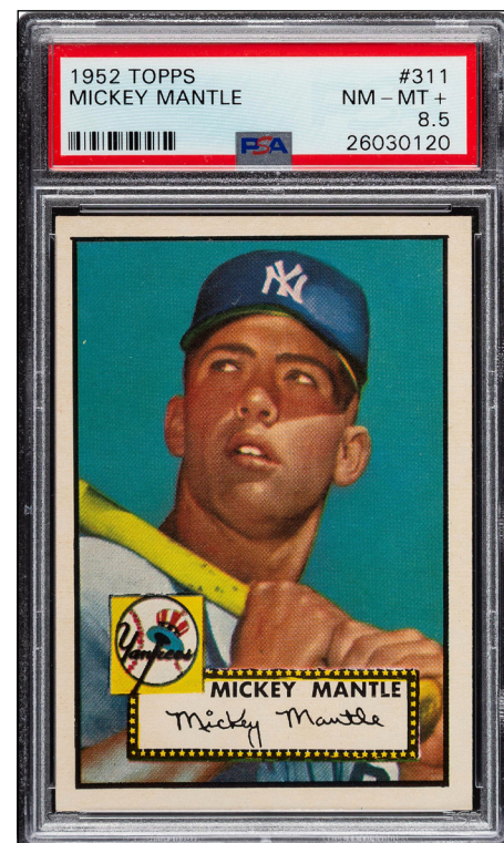
A 1952 Topps Mickey Mantle #311, PSA NM-MT+ 8.5 sold at $765,000.

DALLAS — Heritage Auctions further validated its status as the industry leader December 5-7 as its three-day, 3,000-plus lot trading card auction commanded more than $9,437,190 on the strength of dozens of world-record results. This final major sale of the year carries Heritage sports' auction tally to more than $70 million for the year.