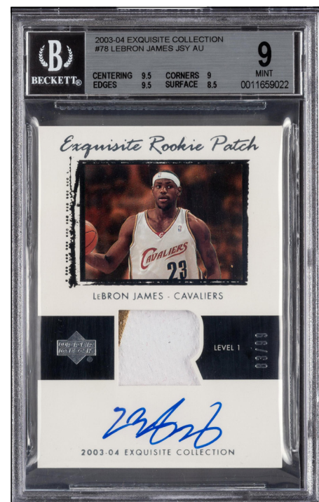
A 2003-04 Upper Deck Exquisite Collection LeBron James Rookie Patch Autograph #78, sold for $228,000.

Prices, with buyer's premium, as reported by the auction house. For more information, www.ha.com or 877-437-4824.