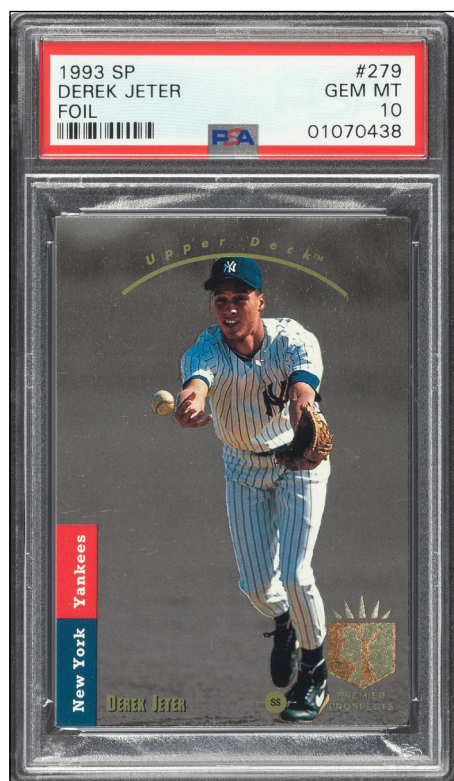
This 1993 SP Derek Jeter #279, PSA Gem Mint 10, drew $138,000.