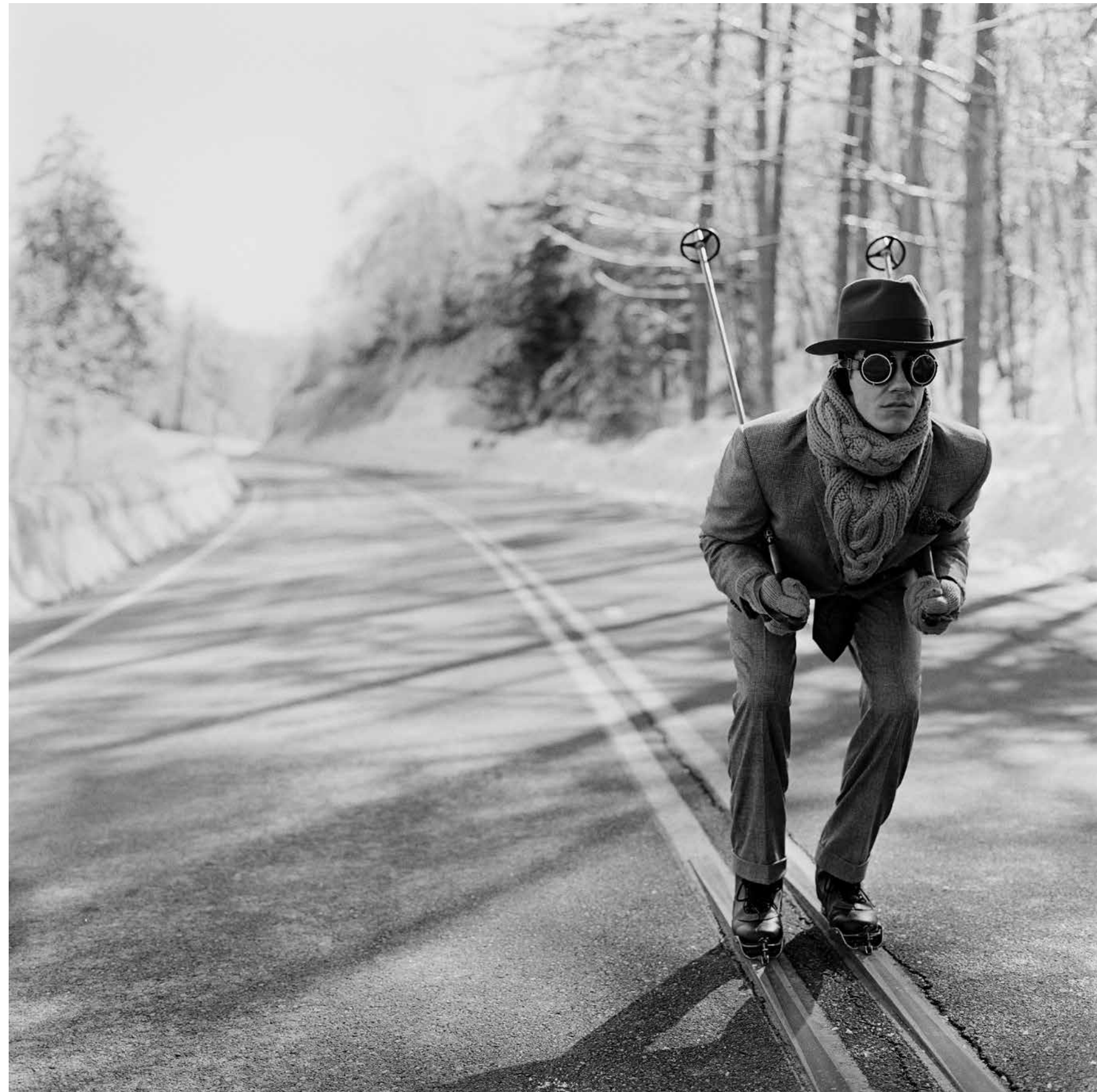
Right page: Reed Skiing, Lake Placid, New York, 2008 Following spread: Three Men with Shears No. 1, Reims, France, 1997