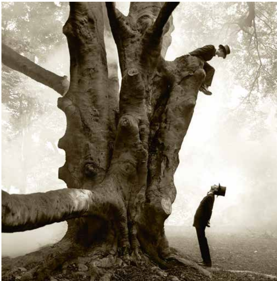
Above: Twins in Tree Snedens Landing, New York 1999