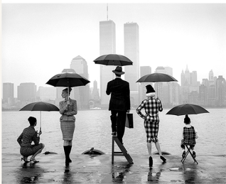
Skyline, Hudson River, New York, in 1995.